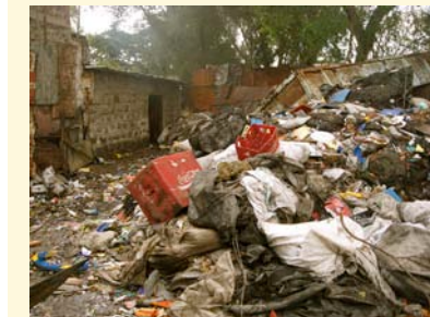
<< The living conditions in Korogocho

"Korogocho is a Kikuyu word which means wreckage – nothingness – emptiness. It is an informal settlement of 300,000 souls nestling around the biggest garbage dump in Kenya. Predictably the community is characterized by socioeconomic and political marginalization under atrocious environmental conditions. However, a number of collective communal efforts have been instrumental in uplifting the socioeconomic well-being, leadership and governance in the community.