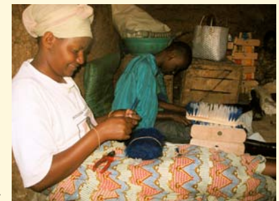
KEYS project workers producing materials from salvaged waste >>

The KEYS (Korogocho Environmental Enterprising Youth) project is implemented in context of massive youth unemployment that exists through out Kenya and especially for slum dwellers. The project builds on efforts by disadvantaged youth in Nairobi's Korogocho slum to create micro-enterprises based on waste salvaged from garbage in the nearby Nairobi City Council dump site, as well as to confront the environmental sanitation challenges in the Korogocho community.